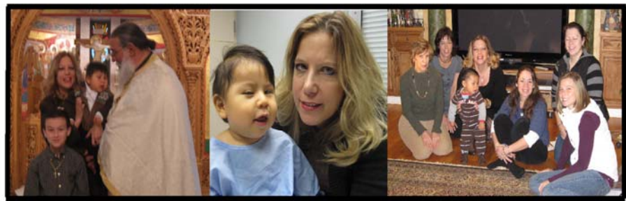
Holy Trinity, Ambridge